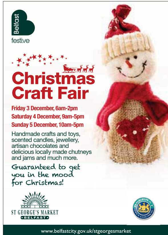
✓ Example: A5 flyer (front)