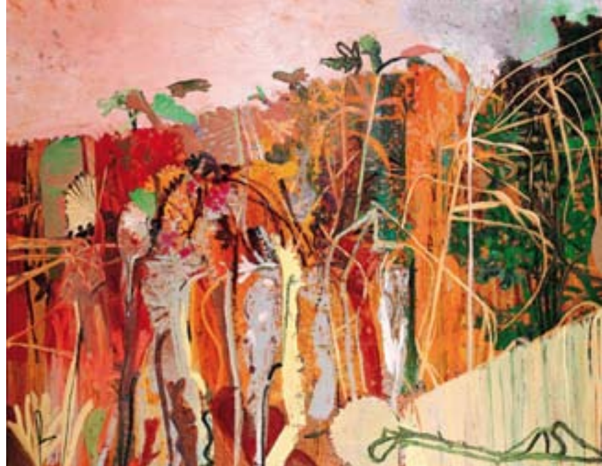
Meadow by David Crone.