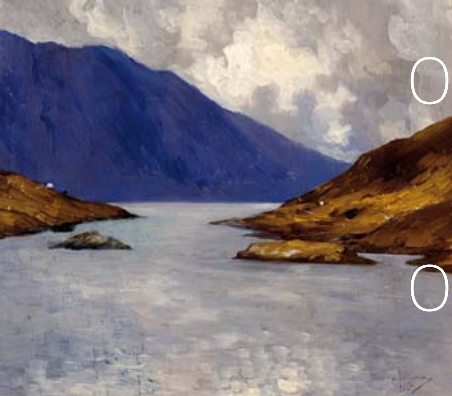
Leenane (1913) by Paul Henry. Collection Ulster Museum, Belfast.