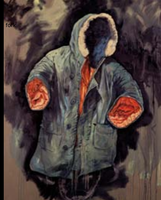
Relic, Oil on Canvas (183 x 122 cms) by Rita Duffy.

New in 2006, established as an off-shoot of the Cathedral Quarter Arts Festival, the Black Box was planned and built inside a wonderfully decorated two-storey 1850s stucco brewery warehouse as a space for 'left field' performances of cabaret, comedy, drama and more music styles that you could shake a stick at. Its White Room's exhibitions take their