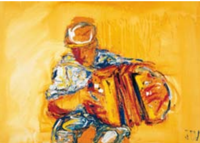
The Yellow Accordion (2000) by John B Vallely, www.jbv.ie