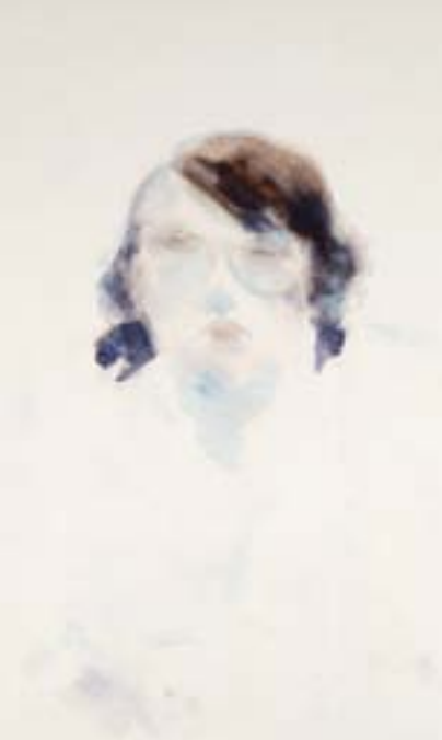
Portrait of Paul Muldoon (1978) by Neil Shawcross. Collection Ulster Museum, Belfast.