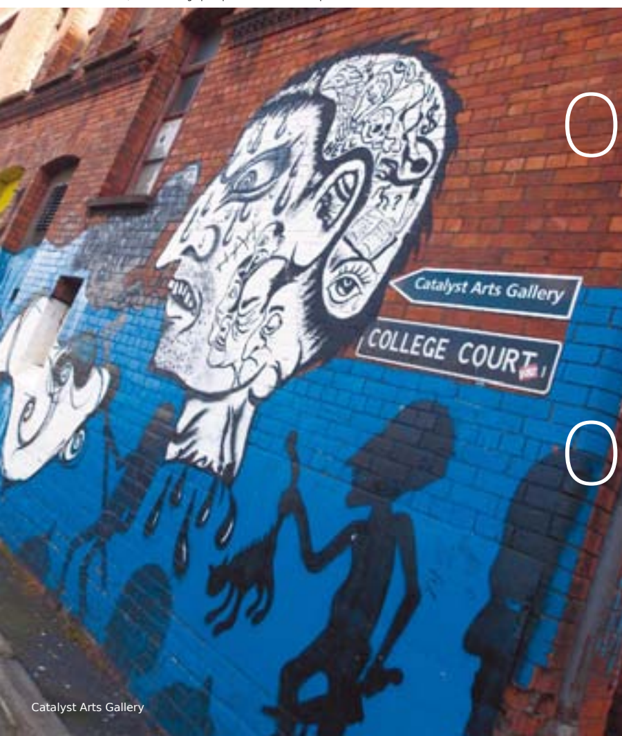
Catalyst Arts Gallery