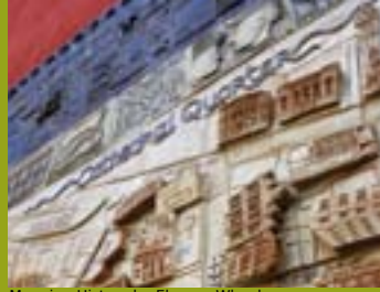
Mapping History by Eleanor Wheeler