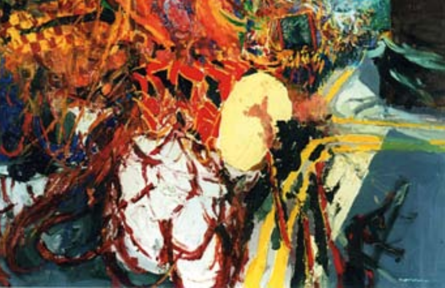
Beating Drums in Donegall Street Number II by Joseph McWilliams. Oil on canvas. UTV Collection.