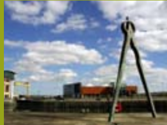
Dividers by Viven Burnside