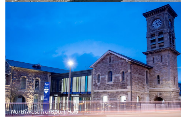
NorthWest Transport Hub